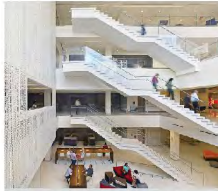
Georgetown University SCS