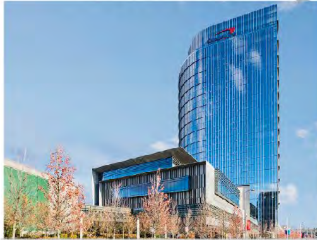
Capital One Block B