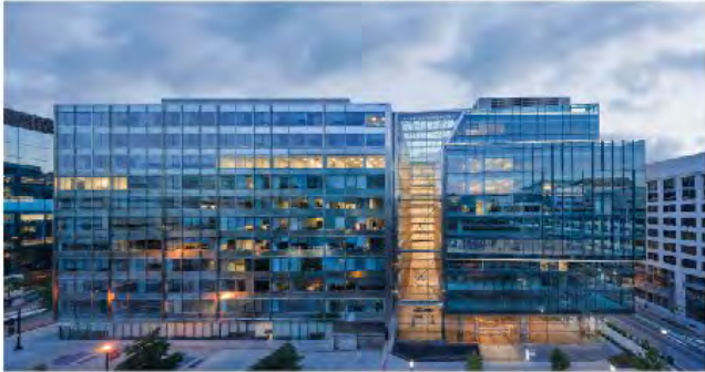
Alexander Court @ 2001 K Street