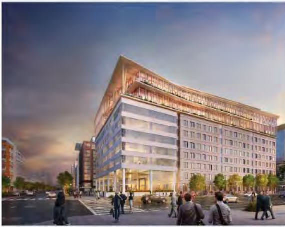
80 M St, SE